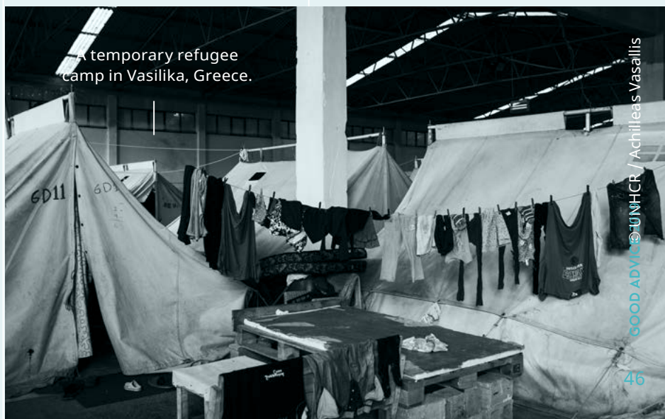
A temporary refugee camp in Vasilika, Greece.

If you have a permit in the responsible Dublin country, it does not pay off